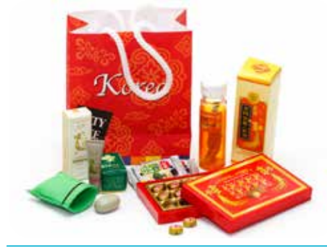
SP Korean Goods