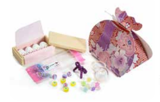
9 These are Baked Goods